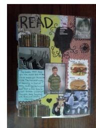
Example of Reader's Notebook

For the Reader’s Notebook, your child is to find and collect photos, pictures, words that show their interest in reading. They may wish to bring in pictures of their favourite books, or of books they may wish to read to decorate the front cover. These items will be stuck onto the front of the Writer’s and Reader’s Notebook as a collage. They will be used to personalise these books and allow your child to see how special these books will be to them.